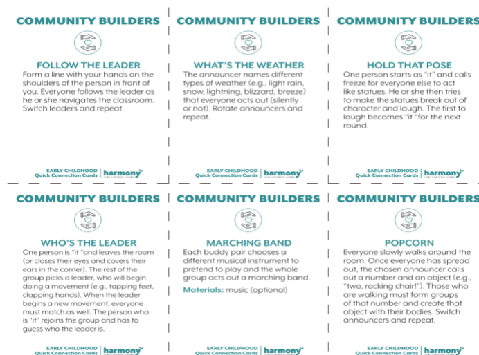
Figure 5. Example of quick connection cards used in community builders activities

The aim of community builders is to foster teamwork among students. It is also hoped that through this activity, students can become more familiar with one another. Additionally, students are encouraged to develop empathy and the ability to assist peers facing difficulties.