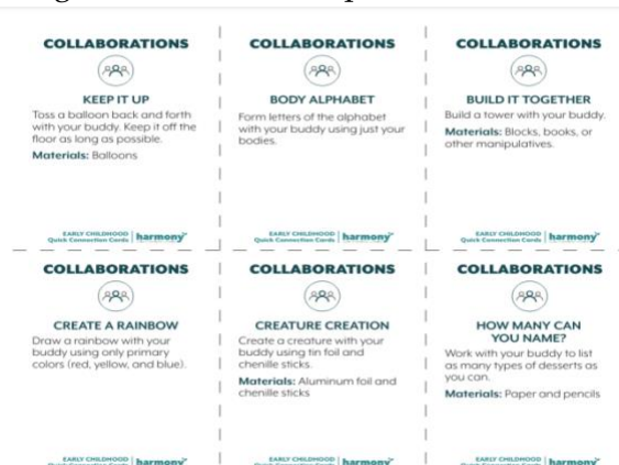
Figure 4. Example of quick connection cards used in buddy up activities

The buddy up activity plays a role in fostering good relationships among students with their peers. The skills honed include students' ability to collaborate, accept differences among friends, and assist peers who are facing difficulties.