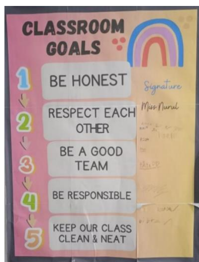
Figure 2. Classroom Goals poster posted in class II